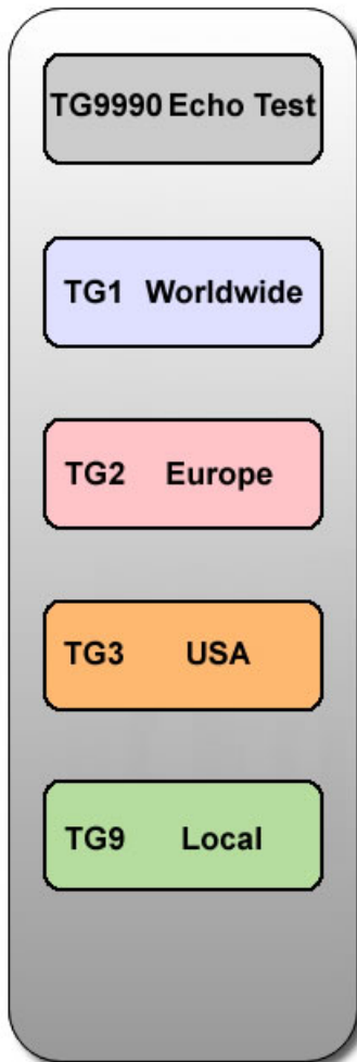
TIME SLOT 1